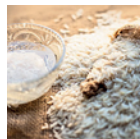
RICE BRAN OIL