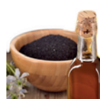
DARK PERILLA OIL